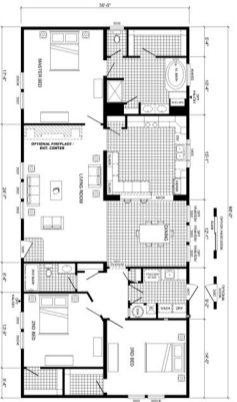
OPTIONAL BUFFET MASTER BATH